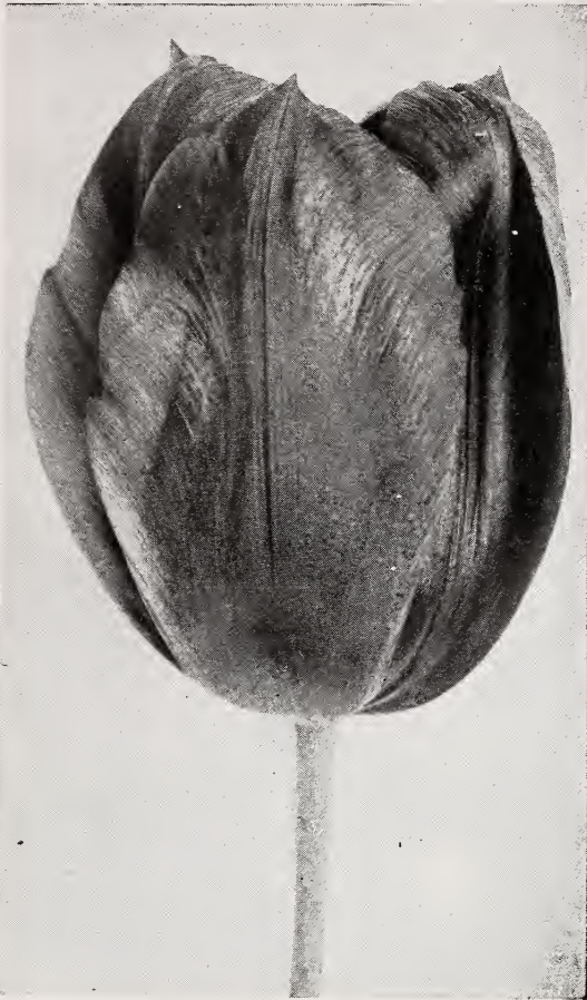
Breeder Tulip, Bacchus.